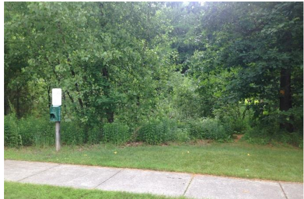
Figure 5: View of proposed retrofit site from roadway.

Detention pond 139, located in the wooded area, just off Sydney Drive is currently covered under permit #1-1186 for the Woodlands development. The detention pond was designed with a flow splitter from Sydney Drive, intended to route a majority of the flow to the detention pond, and overflow to an outfall behind The Commons Condos. The flow splitter has been observed to not function as designed, and most of the flow is diverted to the outfall, with direct discharge to the stream. A proposed retrofit study was completed by Lamoureux and Dickinson in 2007, resulting in a design to upgrade the existing pond, but maintain the system as an open basin. The Town would like to limit the amount of new detention ponds, due to the cost of maintenance and lack of aesthetic appeal and use in the landscape.