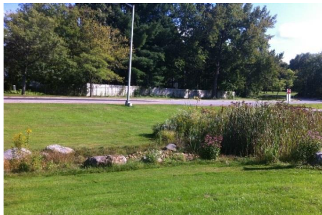
Figure 8: Essex High School Rain Garden

A 1.28 acre area of the existing Essex High School parking lot drains to a rain garden, providing water quality and flow control benefits. Based on the 1-ft contours and field assessment, runoff from an additional 0.33 acres of impervious could be mitigated if the parking lot were regraded to provide positive flow to the east side of the parking lot. The proposed project would involve repaving approximately 0.5 acres of pavement. The existing rain garden has capacity for the additional runoff, and therefore would not require any retrofit to the garden itself, nor would the project increase maintenance demands.