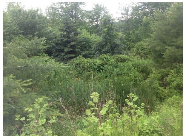
Figure 3: LDS South Pond (P1), exhibiting significant overgrowth.

The other pond on the LDS property, located behind the Church, is heavily overgrown and hard to access from the Church parking lot. Currently, a 1.0 acre portion of the back parking lot is routed to the pond. The proposed retrofit, would convert the existing pond to an underground storage similar to that proposed for the North Pond. The system would consist of a series of 48" HPDE perforated pipes placed in a bed of stone. A horizontal 18" equalization outlet pipe will connect the rows of perforated pipes via an 18" tee at each pipe outlet. The proposed system was sized to mitigate the CPv volume, and will provide water quality benefits from additional filtration through a sand subbase. An alternative option for the retrofit is to place the proposed chamber system under the parking lot, in the event access is an issue for the existing pond location.