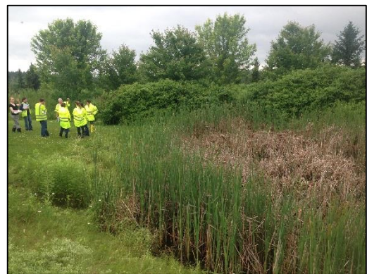
Figure 1: WCA Staff, with Town of Essex Staff and Interns inspecting Essex Outlet Ponds (6/26/14).