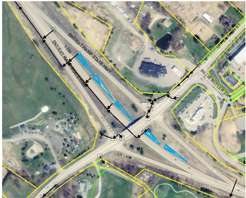
Figure 9: I-289 Exit Ramp with proposed retrofit.

The I-289/Route 15 Exit Ramp was identified as a potential opportunity to manage runoff from primarily VTRANS owned impervious. Two sand filter systems were proposed in the median on the North and South side of the Route 15 overpass (Figure 9). The proposed practice is an approximately 4' deep sand filter, with a 4" underdrain, and 1.5' surface ponding depth before passing over a weir. The system is designed to provide storage for the CPv volume. The low-flow orifice and sand filter provide extended filtration, which provides water quality benefit.