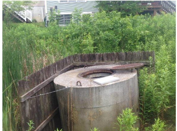
Figure 4: The Commons North Pond Outlet Structure

The proposed retrofit for this pond involves conversion of the pond to an underground storage chamber system, and leveling to ground level to provide additional backyard space. A less costly alternative option, is to convert the wet pond to an expanded gravel wetland with aesthetic improvements including a new outlet structure and landscaping features, sized to mitigate the CPv storm volume.