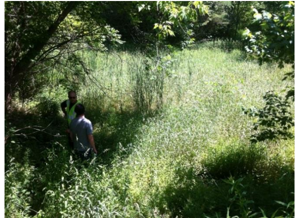
Figure 6: Fairview Dr. natural detention area (6/27/14)

At the corner of Fairview Dr. and Route 15 (Main St), there is an existing natural detention area, controlled by a 12" culvert (Figure 6). The culvert captures runoff from the development above, covered under permit #1-1074, as well as Town land and Route 15, partially owned by VTRANS and the Village. The existing outfall on the North side of Route 15 is severely eroded due to high flows and runoff bypassing the catch basins and flowing over the bank, therefore capture of this runoff was assessed (Figure 7).